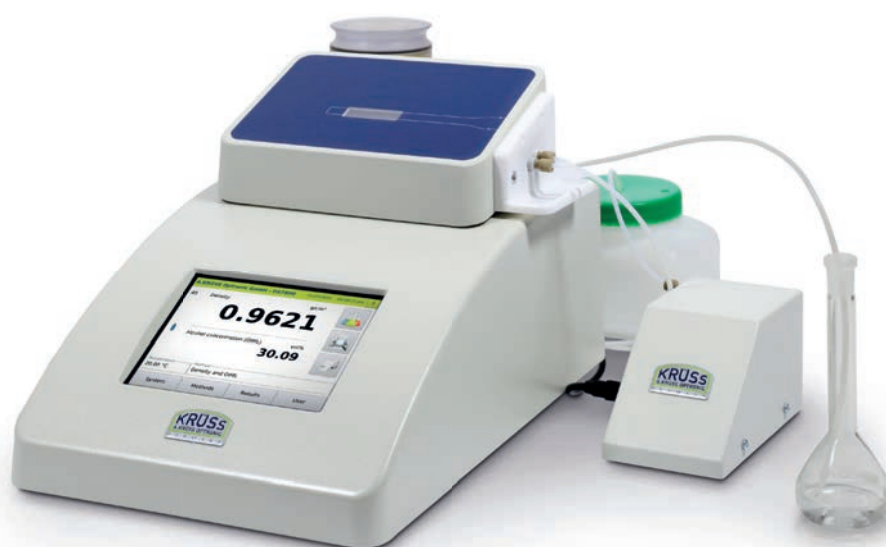
Semi-automatic sample supply via peristaltic pump DS7070

Together with the peristaltic pump DS7070, the AS80 and AS90 autosamplers allow for a fully automatic process. The samples on the Autosampler's rotating plate are removed successively by the suction needle and drawn into the U-tube oscillator by the peristaltic pump. If desired, the system can be automatically rinsed and dried after each measurement.