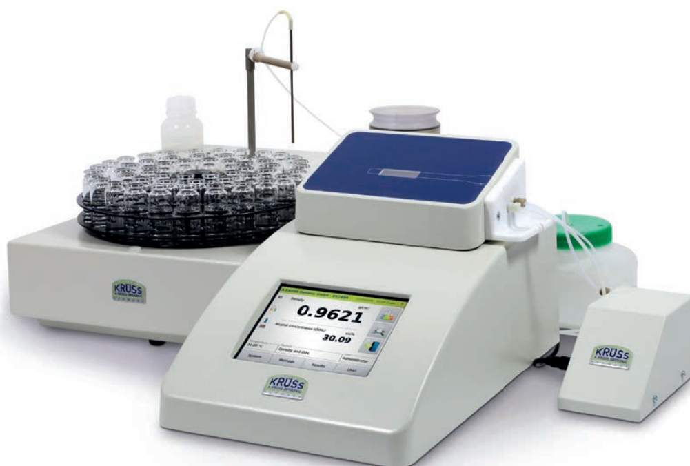
Fully automatic sample supply via autosampler AS90

Our AS80 and AS90 autosamplers can each be fitted with two sample plates of different sizes. One of them is included together with the corresponding vials in the scope of delivery. The sample plates as well as the vials can also be ordered separately.