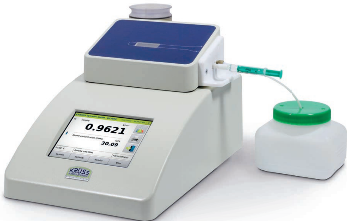
Sample supply via syringe