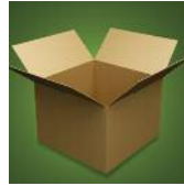
Unprinted carton board