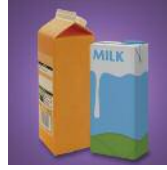
Printed carton board